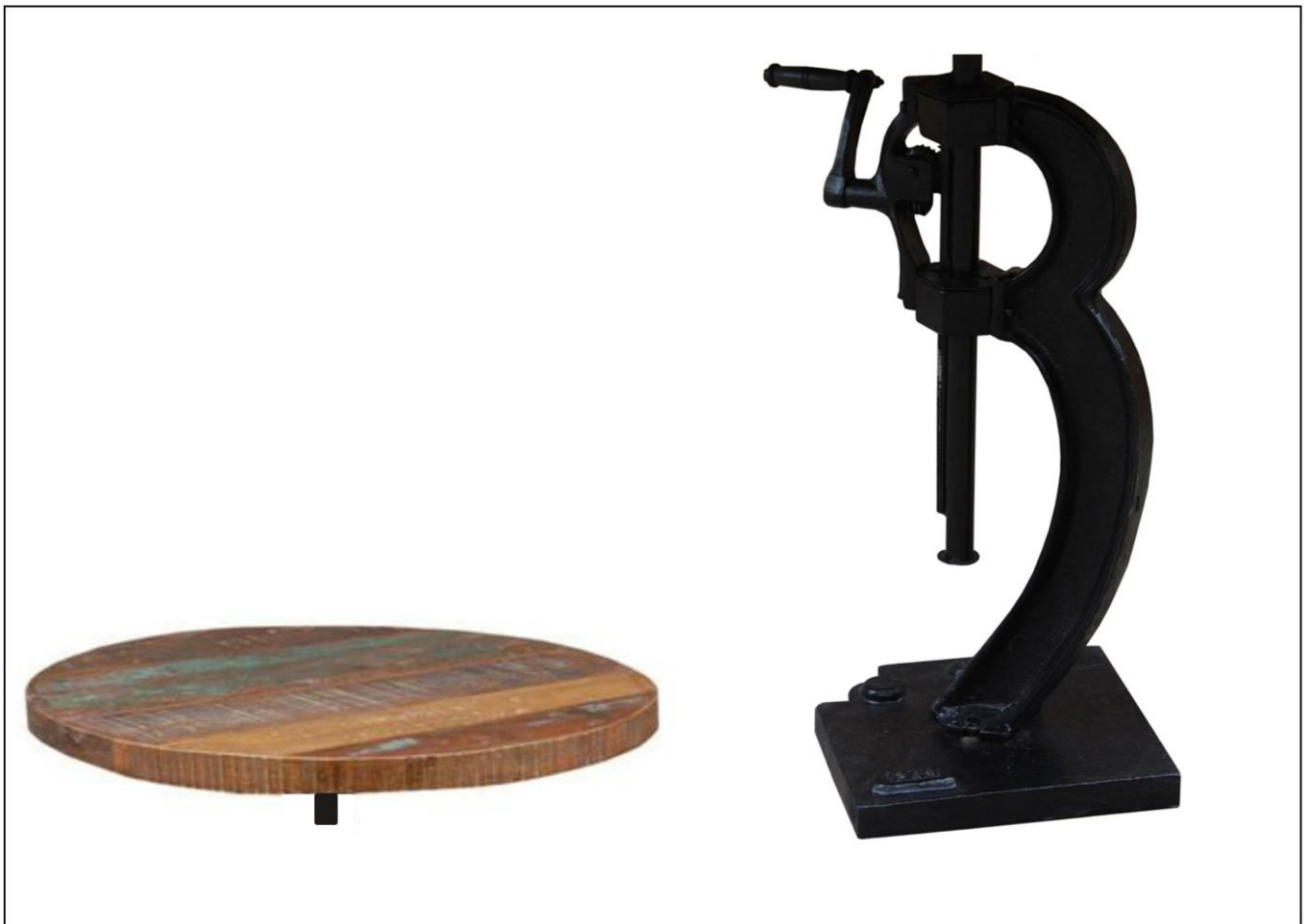
( A )