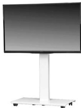
SYZ84-S/XL with single TV installed