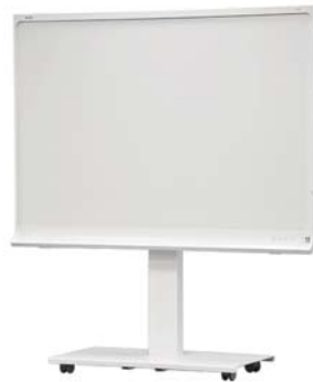
SYZ84-K with *SMART kapp 84® capture board installed