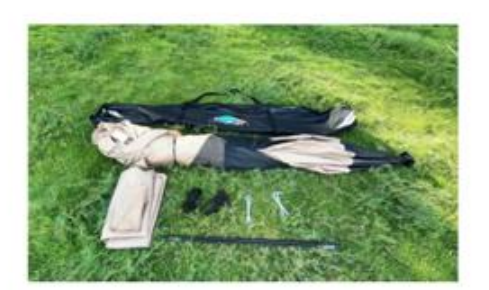
Step 2.Check the parts inside.