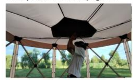
Step 8.Enter through the door and push up on the center ceiling hub until the ceiling pops up.