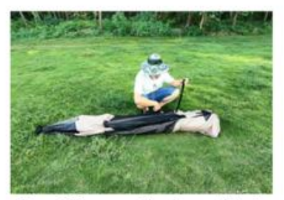
Step 3.Remove the loose fabric wrapped around each of the hubs.