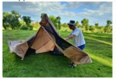
Step 6.Reach for the handle at the center of one wall and pull until the section pops out.