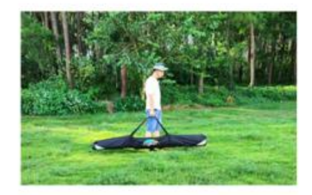
Step 1.Take out the carrying bag.

When you first open the bag on your new screen tent, it may appear inside out. It is not inside out, but is designed to fold nto a compact bag.