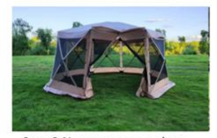
Step 9.Now you are ready to enjoy a bug free, shade filled Summer!

If you want to watch the installation video, please scan the QR code.