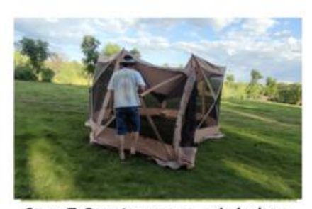
Step 7.Continue around shelter repeating the previous step until all panels are erect.