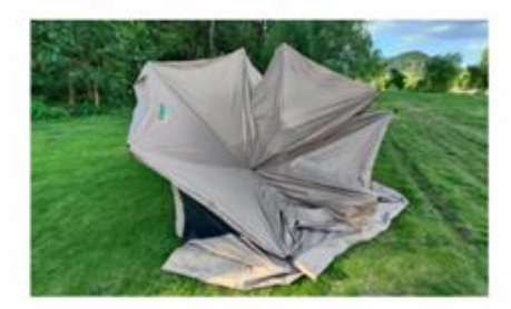
Step 5.Hold one corner of the material and let the screen fall open until you see the roof lying flat.