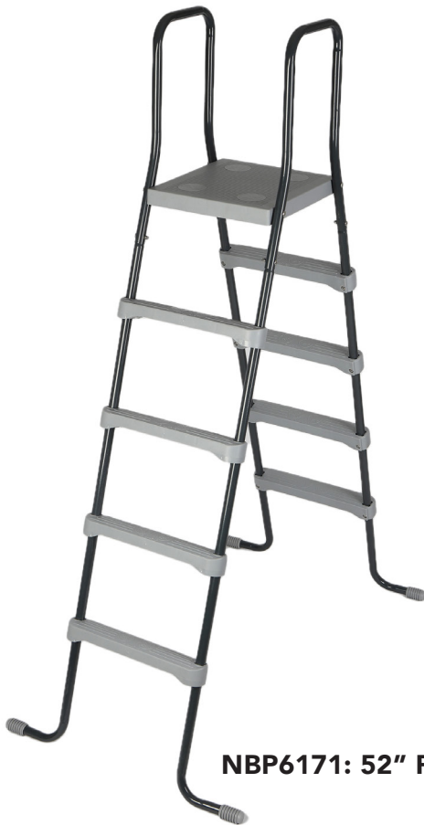
NBP6171: 52" Pools