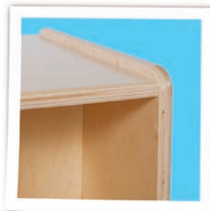
Typical Corners & Edges