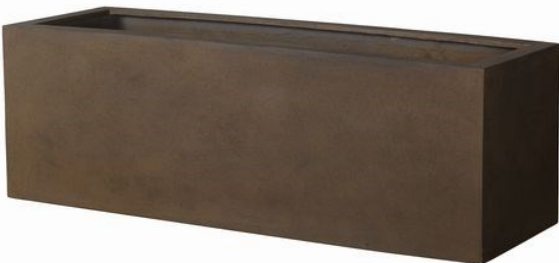
Rust Lite (18)

Actual colors may vary slightly from those depicted in these examples. Color samples are available. Call 215-541-4330 for more information