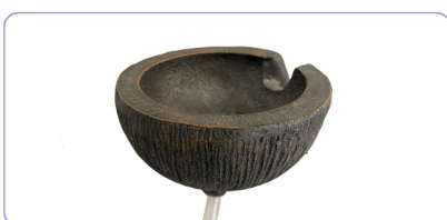
07 KD Part

*The water pump and transformer are housed in the same small box.