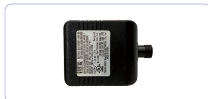
04 Transformer for Pump