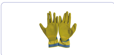
05 Gardening Glove