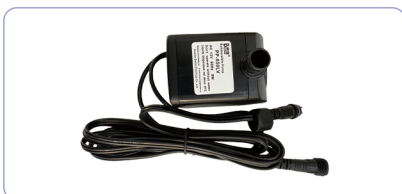
03 Fountain Water Pump