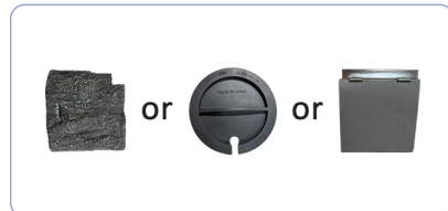
02 Fountain Back Panel