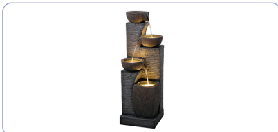
01 Water Fountain