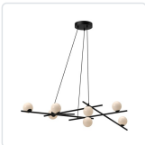
CH89854-BK/GO Black/Glossy Opal Glass