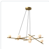
CH89854-BG/GO Brushed Gold/Glossy Opal Glass

* For custom options, consult factory for details.