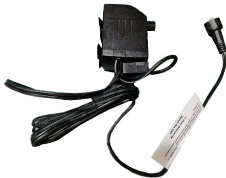
B. Auto Shut Off Pump