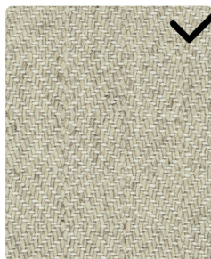
GT03 - BEIGE