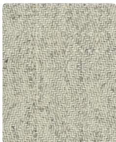
GT01 - SILVER