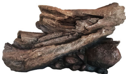
Fountain (3 LED Lights Pre-installed) x1