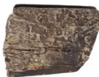
Fountain Back Door x1