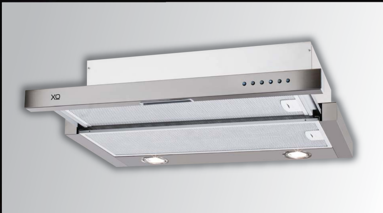
Under Cabinet - Glide Out