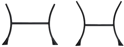
A (Leg A)