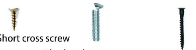
Short cross screw Flat-head cross screw Inner hexagon screw