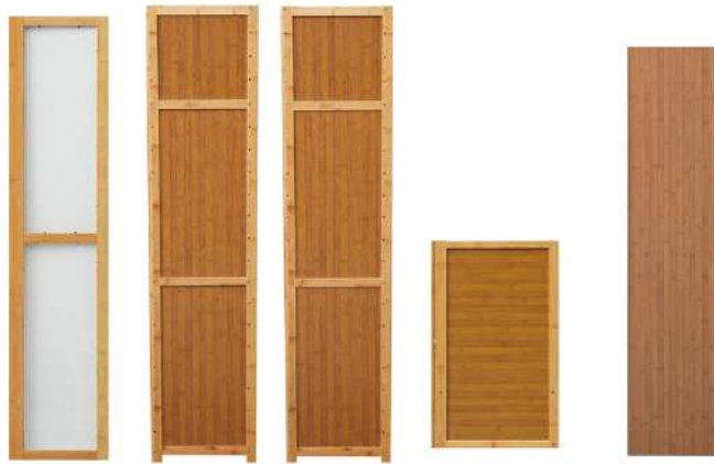
Cabinet door*3 Left bracket Right bracket Back plate*2