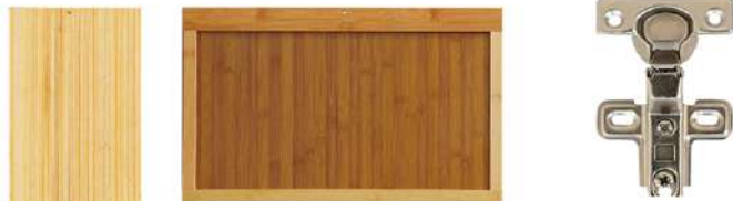
Foot pad*2 Long shelf*4 Hinges*4