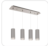
MP401432BN-04 Brushed Nickel