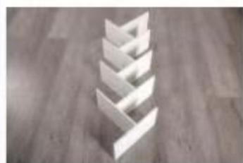
7. Install a roof