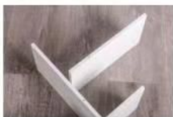
8. Step 7 details