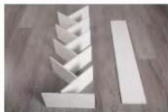
10. Remove the backboard