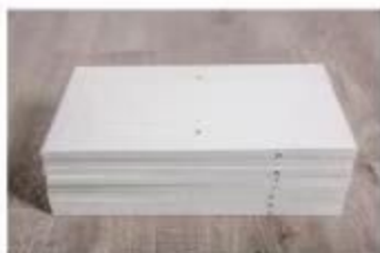
2. Take Out 8 layers