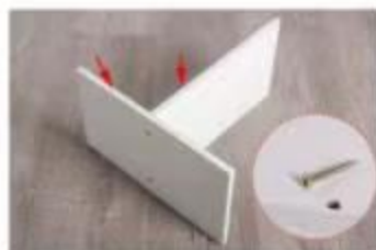
3. Take out the 2 boards and connect them as shown. Note: The two boards face up