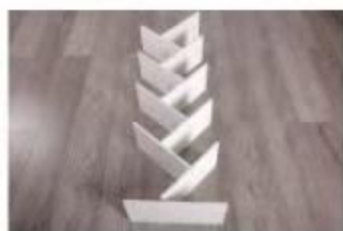
9. Place the bottom plate on the bottom