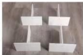
4. Install other combinations in the same way