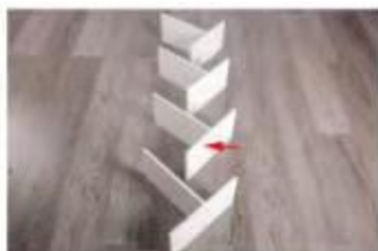
5. Place side faces facing up as shown