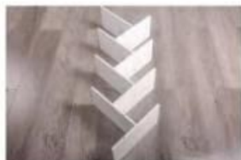
6. Screw the T assembly