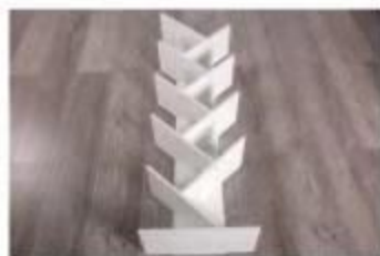
12. Installation complete