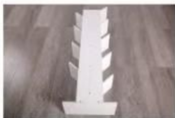
11. Install as shown and secure with screws (step 3 screws)