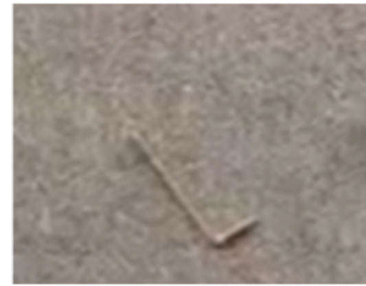
A hexagonal wrench