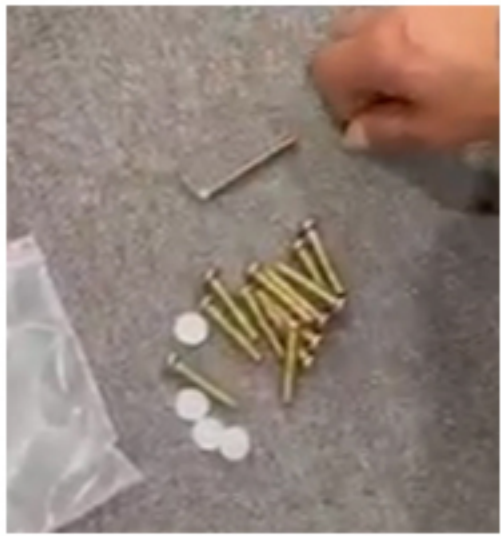
Screws, 12 pieces