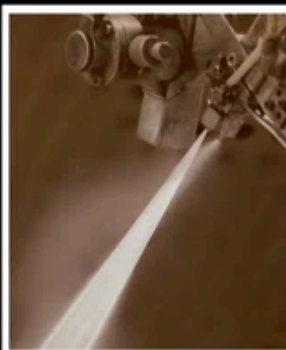
Robotic Fiber Spraying