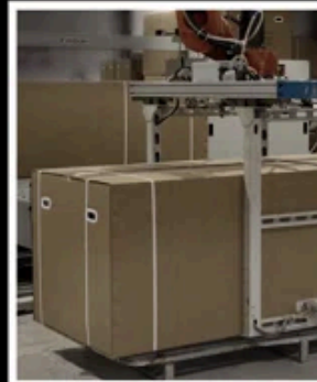
AI Damage-Free Packaging