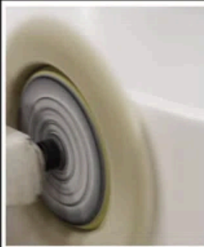
Handcrafted Fine Polishing