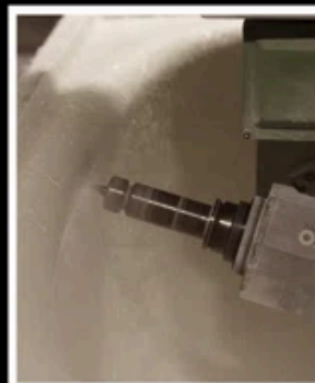
CNC Precision Shaping