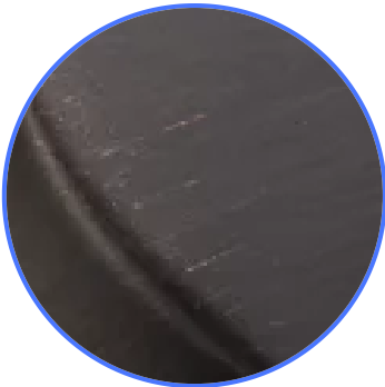
Venetian Bronze - 112, 11P