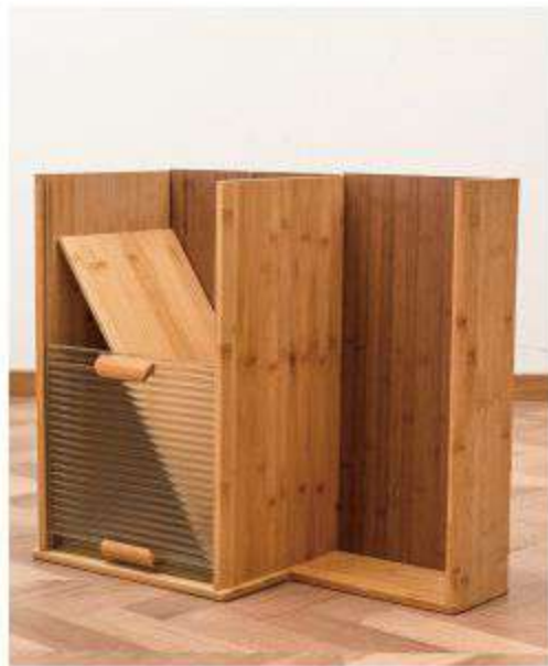
13. Door panel installation is complete.