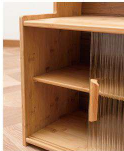
17. The baffle plate are placed as shown.