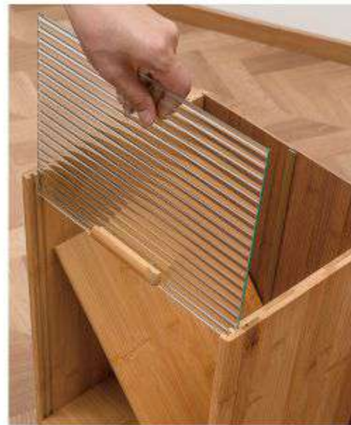
11. Insert the door panel into the groove between the bottom and middle board (note the orientation of the door panel)