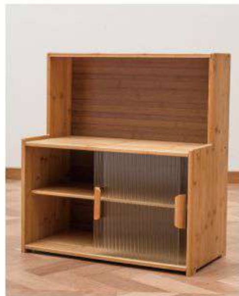
18. Baffle plate installation is complete.