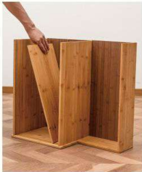
10. Place the baffle plate into the cabinet. Note: No installation required temporarily)