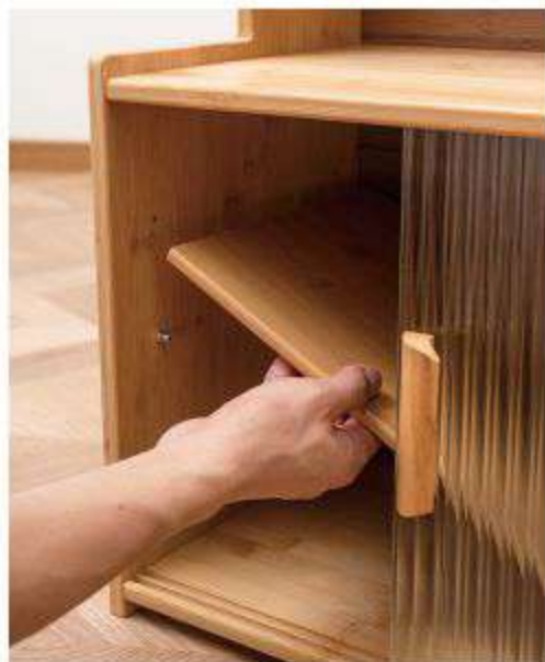
16. Place the baffle plate from step 10 on the plugs.