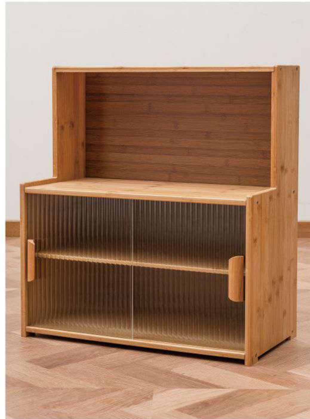
19. Installation is complete.