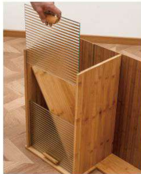
12. Insert the other door panel note the orientation of the door panel)