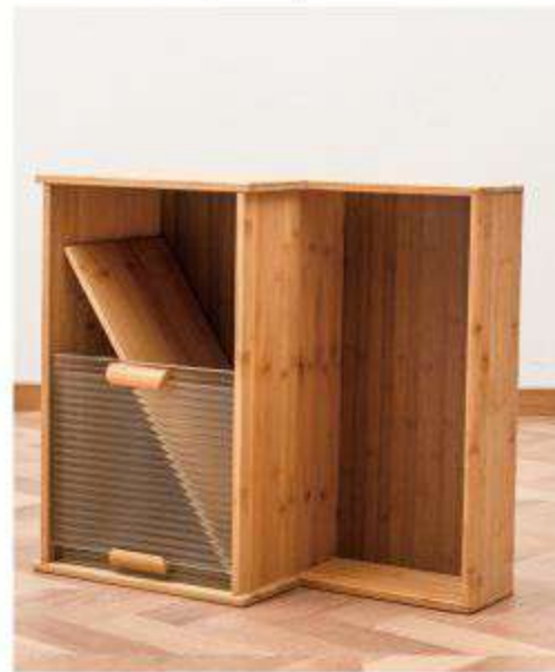
14. Install the left bracket with a long screw.