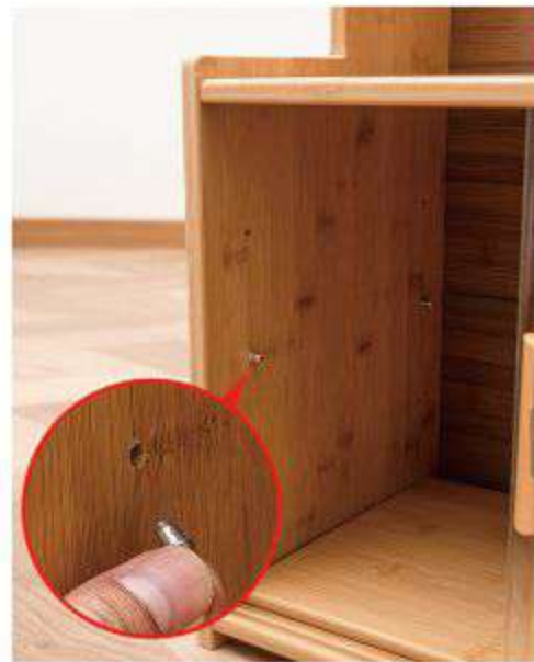
15. Turn the cabinet over to positive and insert the plug in turn.