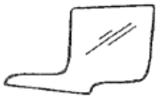
E (1 pc)