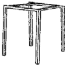
F (1 pc)