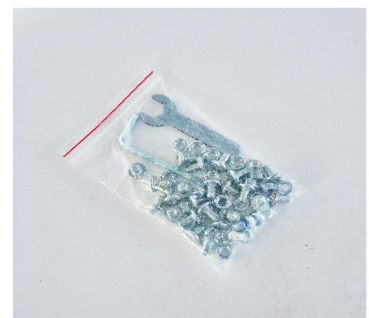
A package of screw accessories