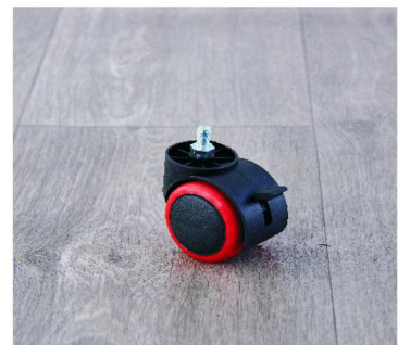
Four brake pulleys

2. Don't tighten the screws. Connect the middle two trays with screws.