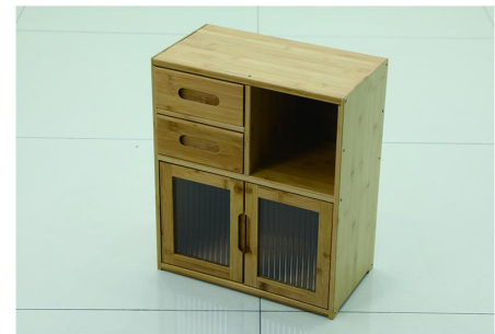
12. Finally, insert the installed drawer.