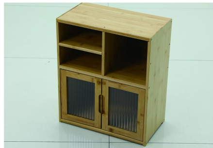
10. Remove the top layer board and install it with large screws.