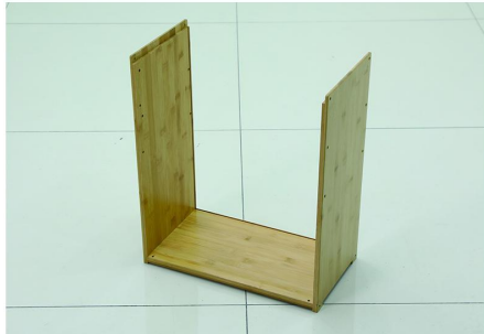
1. Take out the bottom layer board and install the left and right side brackets with large screws (pay attention to aligning the grooves of the layer board and bracket).