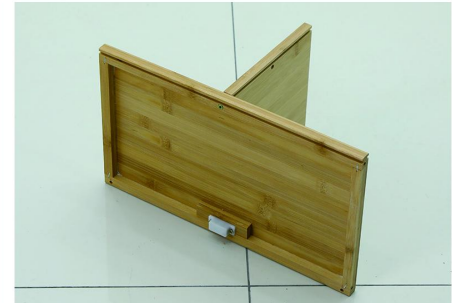
4. Then fix it with large screws and partitions (pay attention to aligning the grooves of the laminates and partitions).