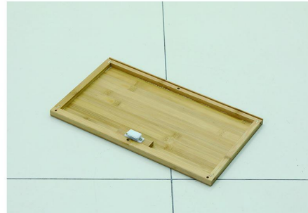
3. Remove the door suction layer board and install the door suction with small screws.