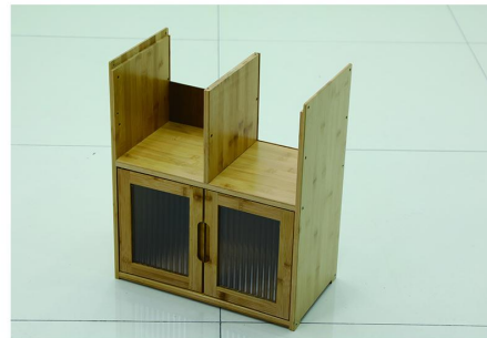
7. Remove the small backplane and insert it along the groove.