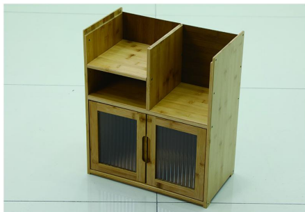
9. Remove the small backplane and insert the middle backplane along the groove.