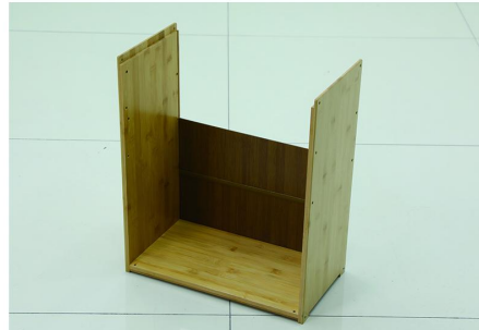
2. Take out the long backplane, insert the backplane strip along the groove.