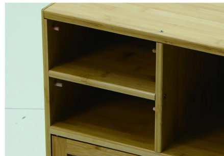
11. Remove the plug and insert it into the hole.