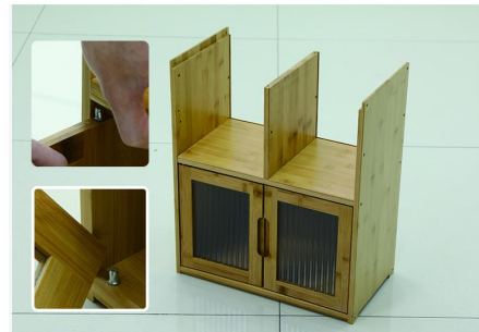
6. Remove the door panel and install the door bolt, and finally tighten the front screws.