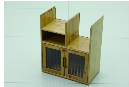
8. Remove the small layer board and install it with large screws.