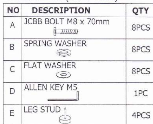
Hardware List (For 1 Table)