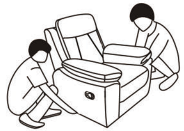
To move the recliner sofa Only from the bottom side of the recliner sofa