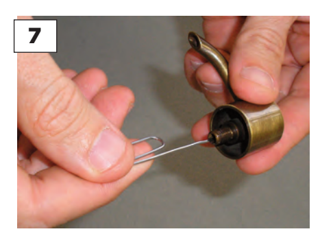
Next, insert the paper clip into the threaded neck. Again, force will be required to drive the clip through the entire length of the neck and clear the debris.