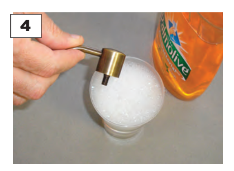
Soak the top portion in hot water and dishwashing soap to loosen clogged debris.