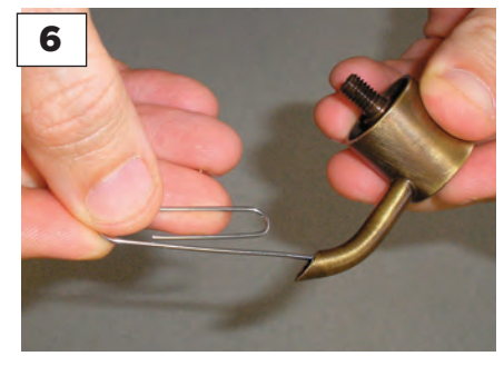
First insert the paper clip into the spout. Some force will be required to drive the clip through the entire length of the spout and fully clear the debris.