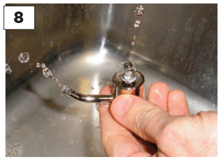
To confirm the top portion is completely clear, hold it as shown and run water through the threaded neck. Repeat steps 6 & 7 and continue to flush until a steady stream of water flows through the threaded neck and out of the spout.