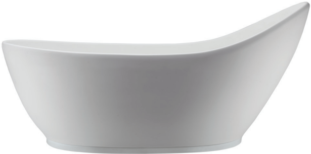
Features an integrated overflow.