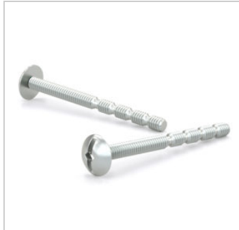
Breakaway Machine Screw, Large Truss Head, Combined Quadrex Slot Drive, 8-32, Type B Point Product № 2905 Packaging format: Bag of 50 units