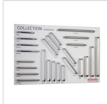
Expression Board - 98129