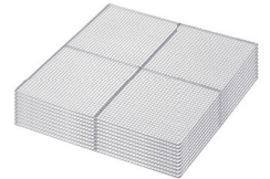
Pack of 10