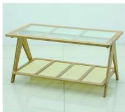
Complete the diagram