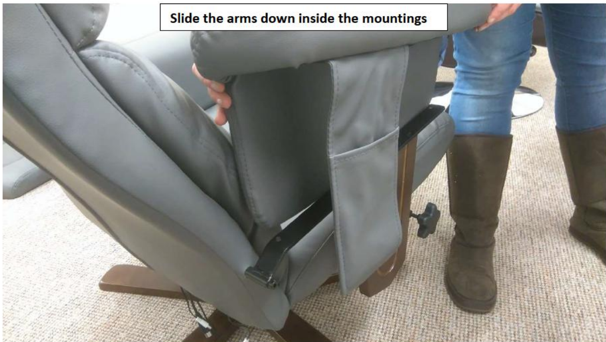
THIS PHOTO ABOVE SHOWS THE RIGHT ARM WITH THE REMOTE POCKET