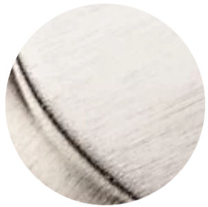
Satin Nickel - 150, US15