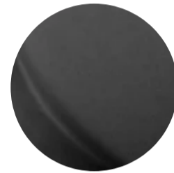
Satin Black - 190