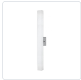
WS8432-BN Brushed Nickel