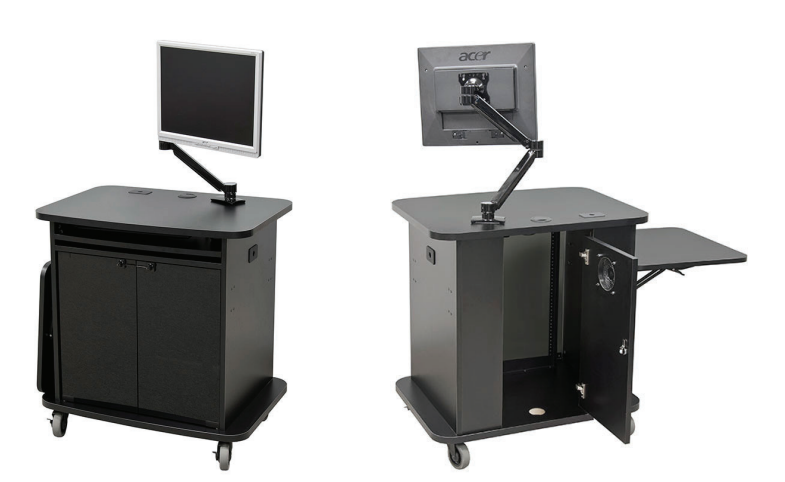
Shown with optional C900S (Sold separately)

This versatile multimedia cart model 103324 has been designed with functionality as its main characteristic. The top surface is large enough to accommodate up to 32" monitors or for your computer screens, visual presenters or laptops. Extra charge for custom cutouts for electronics or other items specified by the customer.