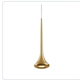
402601BG-LED Brushed Gold