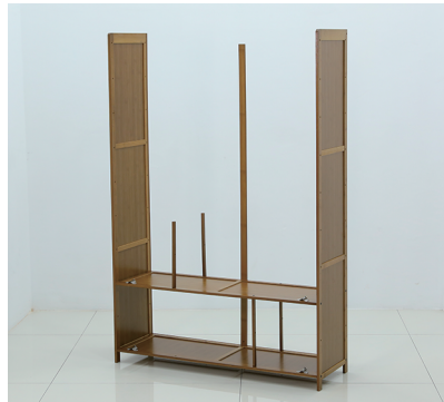
⑥ Install 2 more Support Slats (k) on the Panel from Step 5 with Large Screws (o).