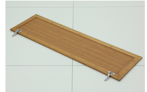
② Install them on Door Panels (i) with Small Screws (q).