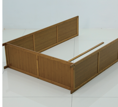
③ Position and secure Back Support Slat (e) with Large Screws (o). © 2020-2021 by Pundarika LLC - MoNiBloom.com