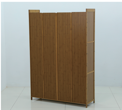
⑪ Insert Back Panels (d) then follow Step 10 to insert all the Back Panels (c).