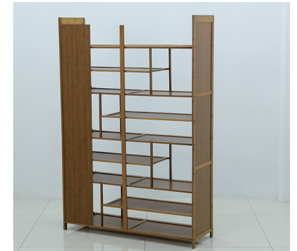
⑩ Flip around the frame , insert Back Panel (c) along the groove.