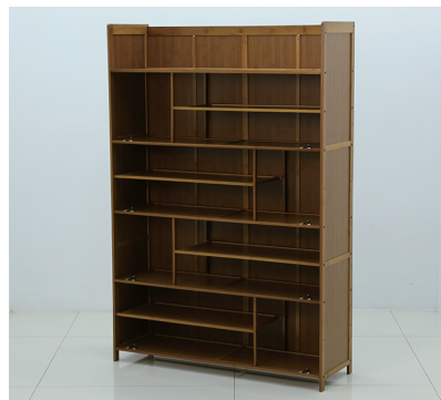
⑬ Flip around the frame.