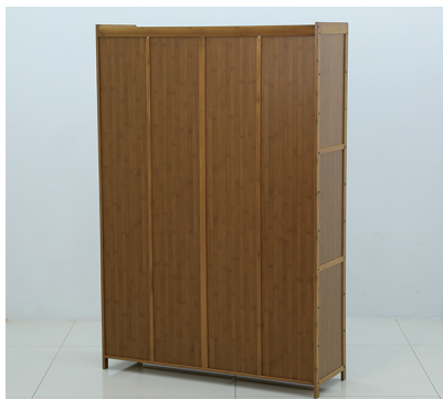
⑫ Position Top Slat (g) as picture shown, secure it with Large Screws (o) and Long Screw (n) from the top.