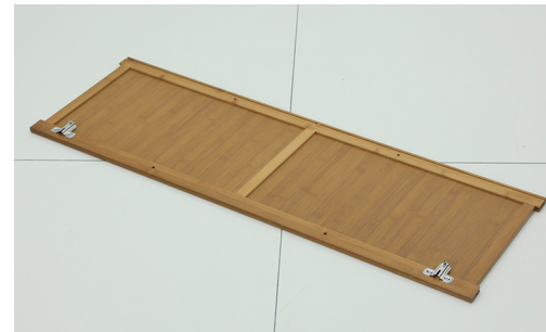
Install the other half of the Separated Hinge onto Bottom Panel (h) with Small Screws (q).