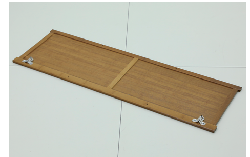
Install them onto Panels (m) with Small Screws (q).