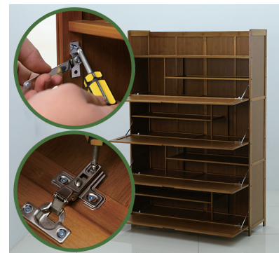
⑭ Install all the Door Panels (i) and Hinges (r) with Small Screws (q).