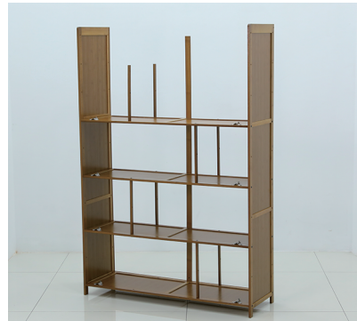
⑦ Repeat Step 5 and 6 until all the Support Slats (k) are used.