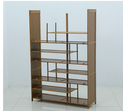
⑧ Install Small Panels (l) as picture shown with Large Screws (o).