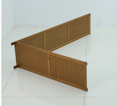
① Position and secure Left Side Panel (a) and Bottom Panel (h) with Large Screws (o). Align the groove on both Panels.