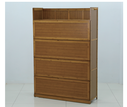
⑮ Install Bottom Cover (f) with Medium Screws (p).