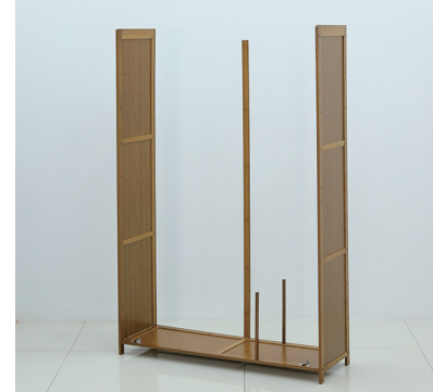
④ Install 2 Support Slats (k) with Large Screws (o) as picture shown.