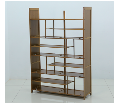
⑨ Install Top Panel (j) with Large Screws (o).