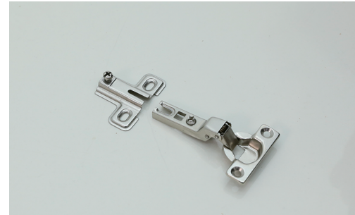
① Separate Hinges (s).