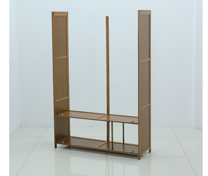
⑤ Install Panel (m) on the Support Slats (k) with Large Screws (o).