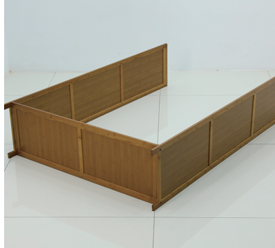
② Install Right Side Frame (b) with Large Screws (o).