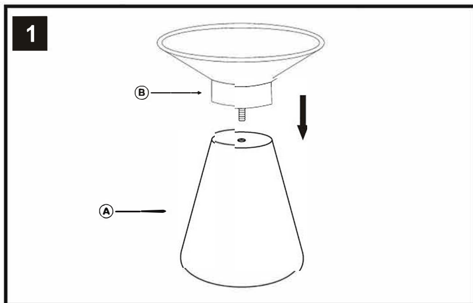
STEP -1: PUT TOP (B) ON BASE (A)