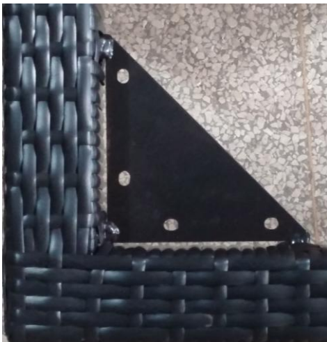
Top side of frame