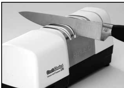
Figure 2. Inserting the blade in the right slot of Stage 1. Alternate pulls in left and right slots.