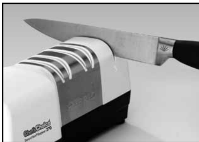
Figure 6. Knife in Stage 3. Use back and forth sharpening strokes with light downward pressure. See text.