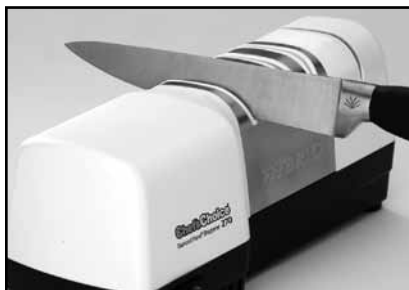
Figure 1. Inserting the blade in the left slot of the Stage 1. Alternate individual pulls in left and right slots.

Make one pull of the blade in the left slot as described above and then repeat the same procedure in the adjacent (right) slot of Stage 1. As you pull the knife thru the right slot, (see Figure 2), hold the right face of the knife against the slanted right face of the slot. If your knife, before sharpening, is not very dull you will find that only about 5 pairs of pulls, alternating in the left and right slots of Stage 1 , will be sufficient to put a keen edge on the