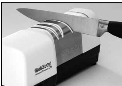
Figure 4. Inserting the knife in left slot of Stage 2. Alternate individual pulls in left and right slots.