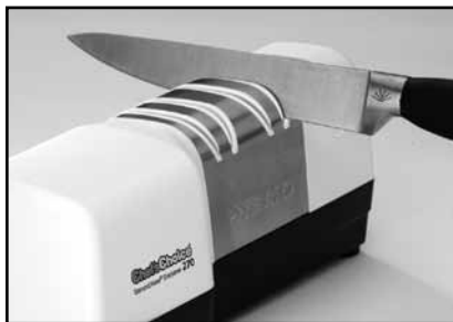
Figure 5. Inserting the knife in right slot of Stage 2. Alternate individual pulls in left and right slots.

To resharpen follow the procedure for Stage 3 described above, making two to three (2-3) complete back and forth stroke pairs while maintaining recommended downward pressure. Listen to confirm the sharpening disks are turning. Then test the edge for sharpness. If necessary resharpen again but first use Stage 2 followed by two to three (2-3) back and forth pairs of strokes in Stage 3. In severe cases with a very dull knife you may find it necessary to repeat Stages 1, 2 or 3 as described above. Generally you should be able to resharpen several times using only Stage 3 before having to resharpen in Stage 2 or 1.