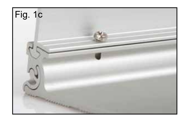
Step 2. Once all support feet are secured to the bottom of the ramp extensions, organize sections from lowest to highest height. Each ramp extension will have to be secured to the piece next to it.

Repeat with additional support feet (if necessary).