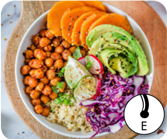
SLICE FRUIT AND VEGETABLES