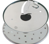
SLICING AND GRATING DISCS