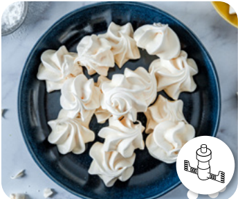
WHISK EGG WHITES