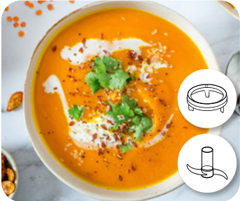
BLEND SOUPS AND SMOOTHIES