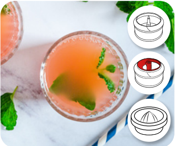
EXTRACT JUICES & PRESS CITRUS FRUITS*