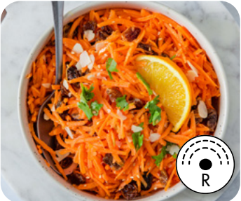
GRATE CHEESE AND VEGETABLES