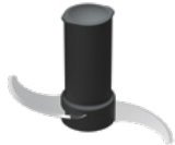
STAINLESS STEEL BLADE