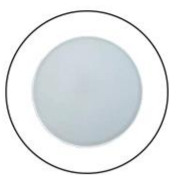
Headlamp with LED