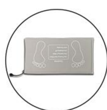
Foot Heating Plate