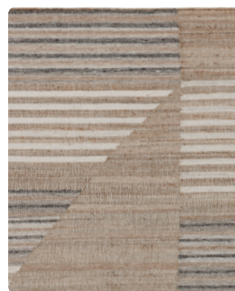
IVNA - IVORY NA- TURAL