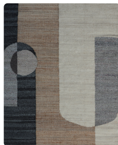
NAIV - NATURAL IVORY