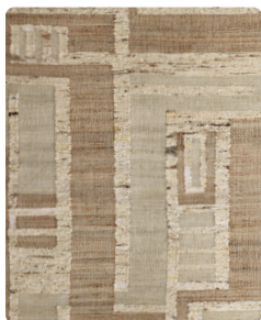
NASI - NATURAL SILVER