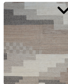
NATU - NATURAL