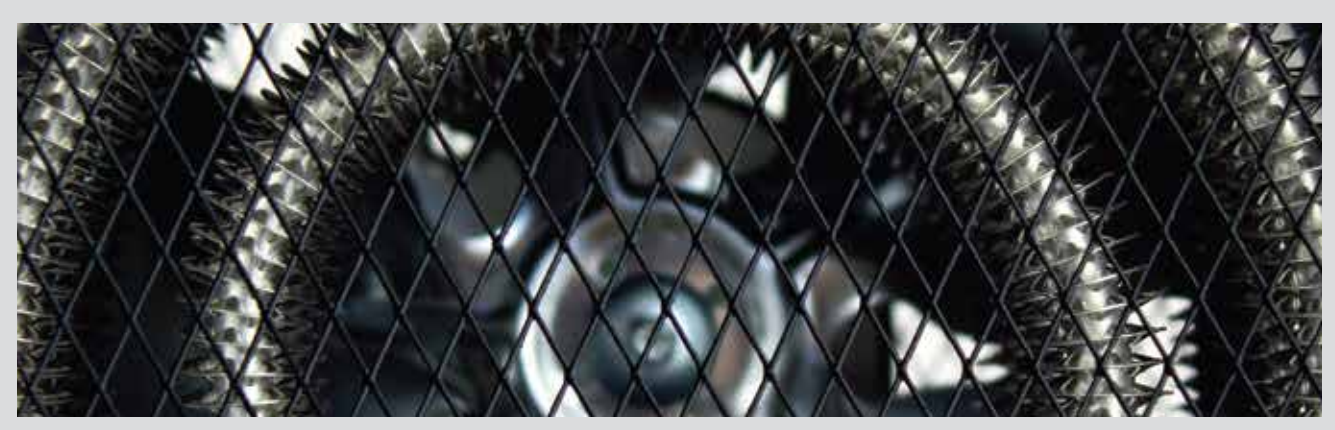
Spiral Steel Fin Heating Element For Maximum Heat Exchange