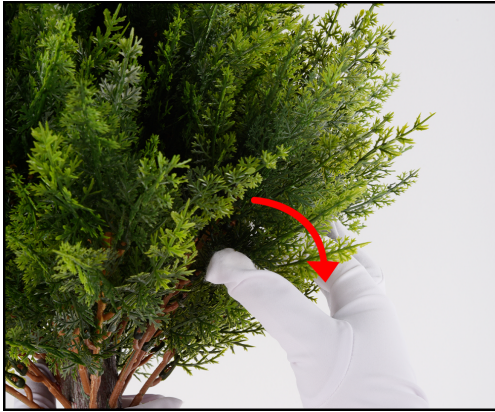
Step 3: Adjust the branches to fluff the trunk and leaves to the desired fullness.