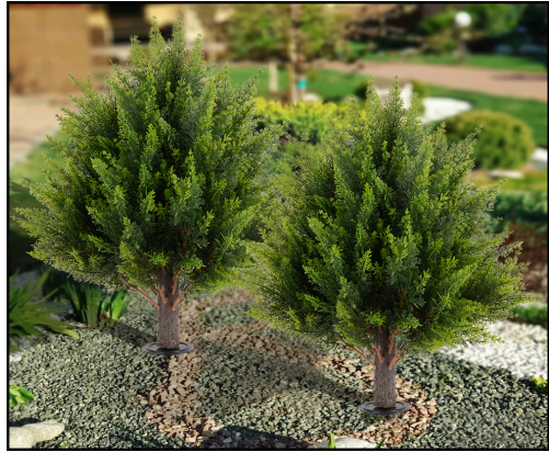
Step 4: Easily installed in soil or decorative planters.