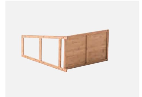
② Secure Left Frame (a-A) and Tier 1 Panel (d) as picture shown.

© 2020-2025 by Pundarika LLC - MoNiBloom.com