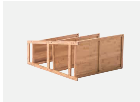
③ Secure Panel (b) (c) as picture.

© 2020-2025 by Pundarika LLC - MoNiBloom.com