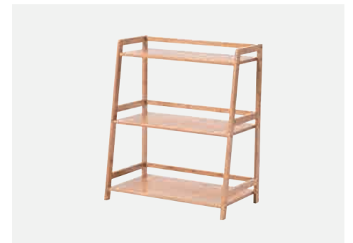
⑥ Install Slat (e) on the rack.