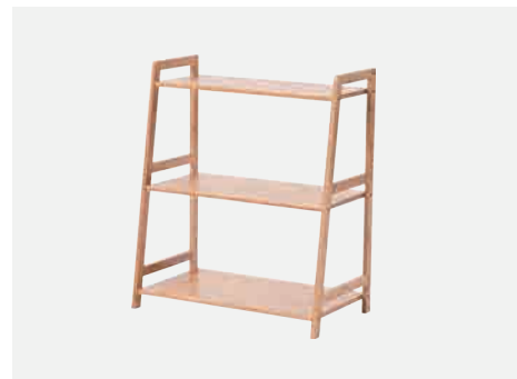
⑤ Stand the rack as picture shown.