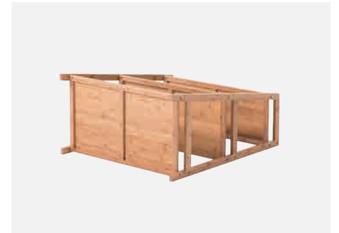
④ Secure Right Frame (a-B).