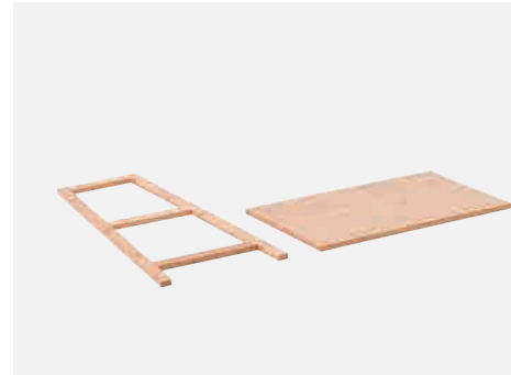
① Position Left Frame (a-A) and Tier 1 Panel (d).