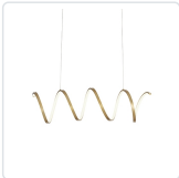
LP93742-AN Antique Brass