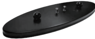
Base X 1