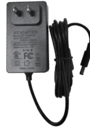
AC Adapter X 1