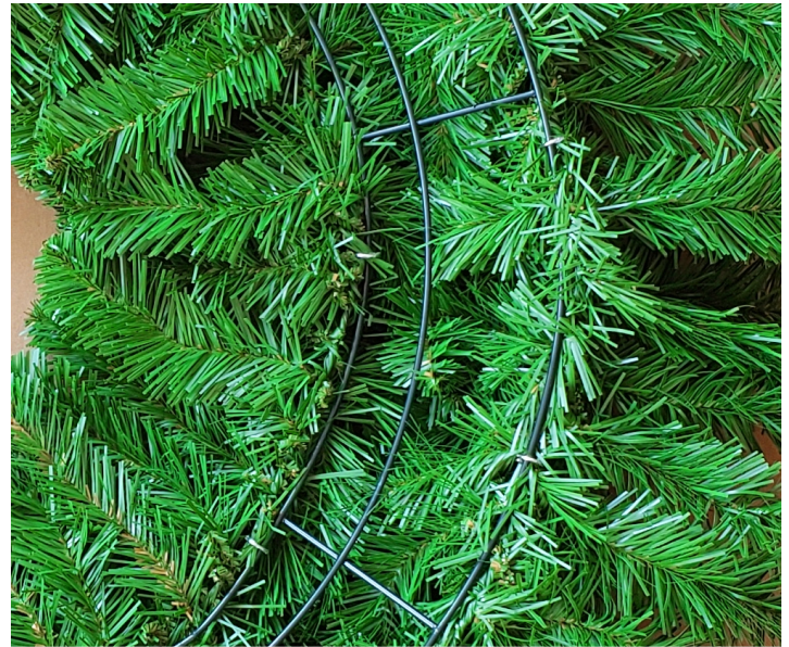
Commercial Grade Frame and PVC Noble Fir