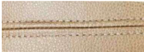
Slight Shade Variation